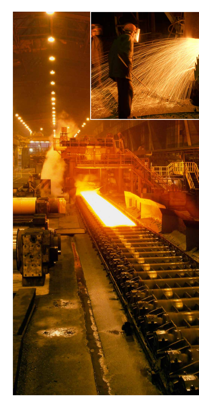
We apply the ISO 9001 standard and the DS/OHSAS 18001 working environment system - that obliges us to deliver high quality.

MEGA FLEX's concept ensures that all jobs are carried out by highly qualified and motivated personnel, both in terms of management and performance of the job.