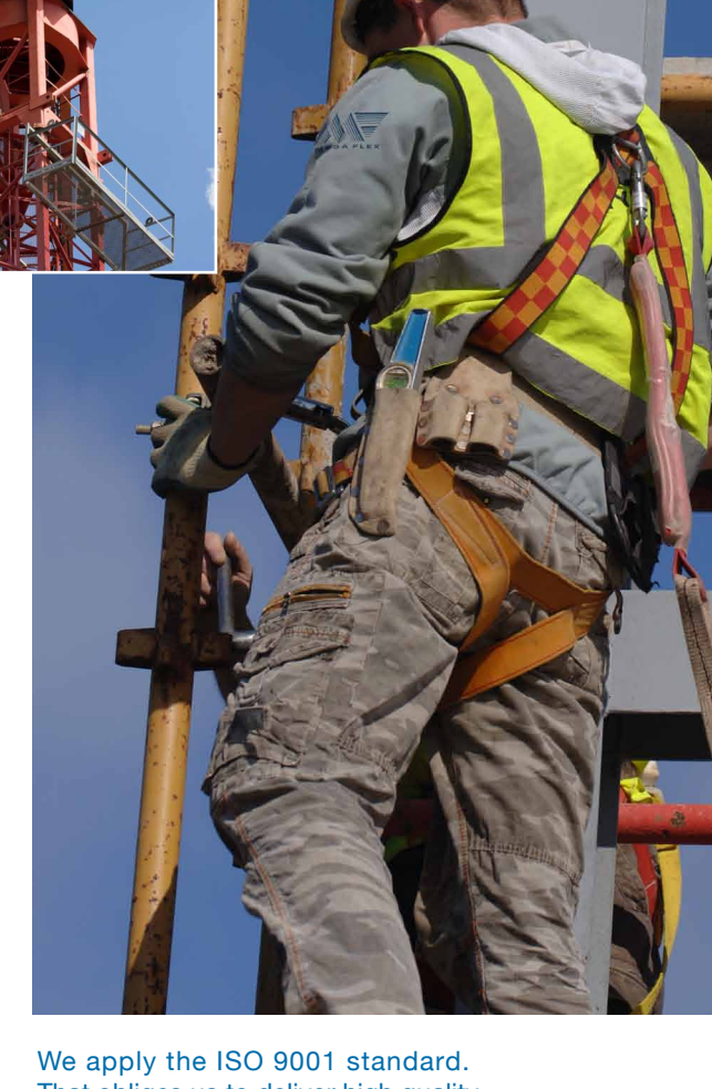
That obliges us to deliver high quality.

We are very flexible and look forward to working with you and your company.